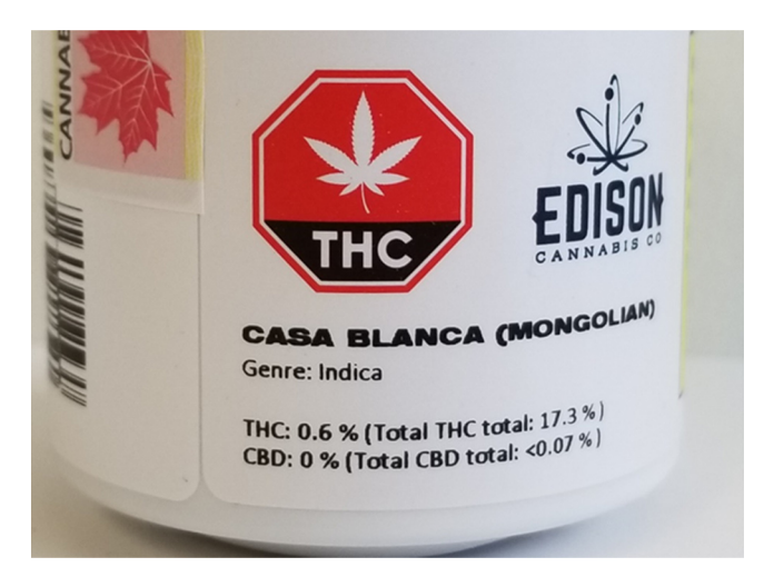
Fig. 1. THC and CBD labelling on Canadian dried herb products.

In most legal markets, the dose of cannabis products is communicated in the form THC numbers printed on packages. In Canada, cannabis products must display the milligrams (mg) of "THC per unit"