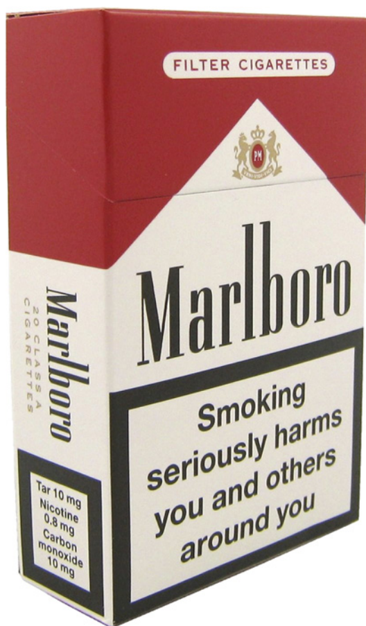
Figure 2 An example of EC/UK text-only warnings (2003).

information processing and improve memory for the health message.