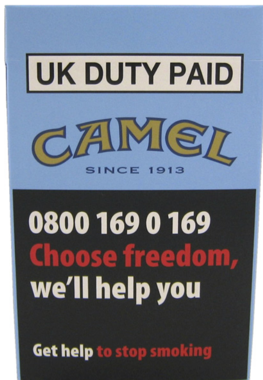
Figure 4 An example of supportive, cessation-oriented messages in the UK (2010).

Future research on tobacco health warnings should consider effective types of message content for pictorial warnings to a greater extent. There is a particular need to evaluate different themes or 'executional styles', including the potential impact of