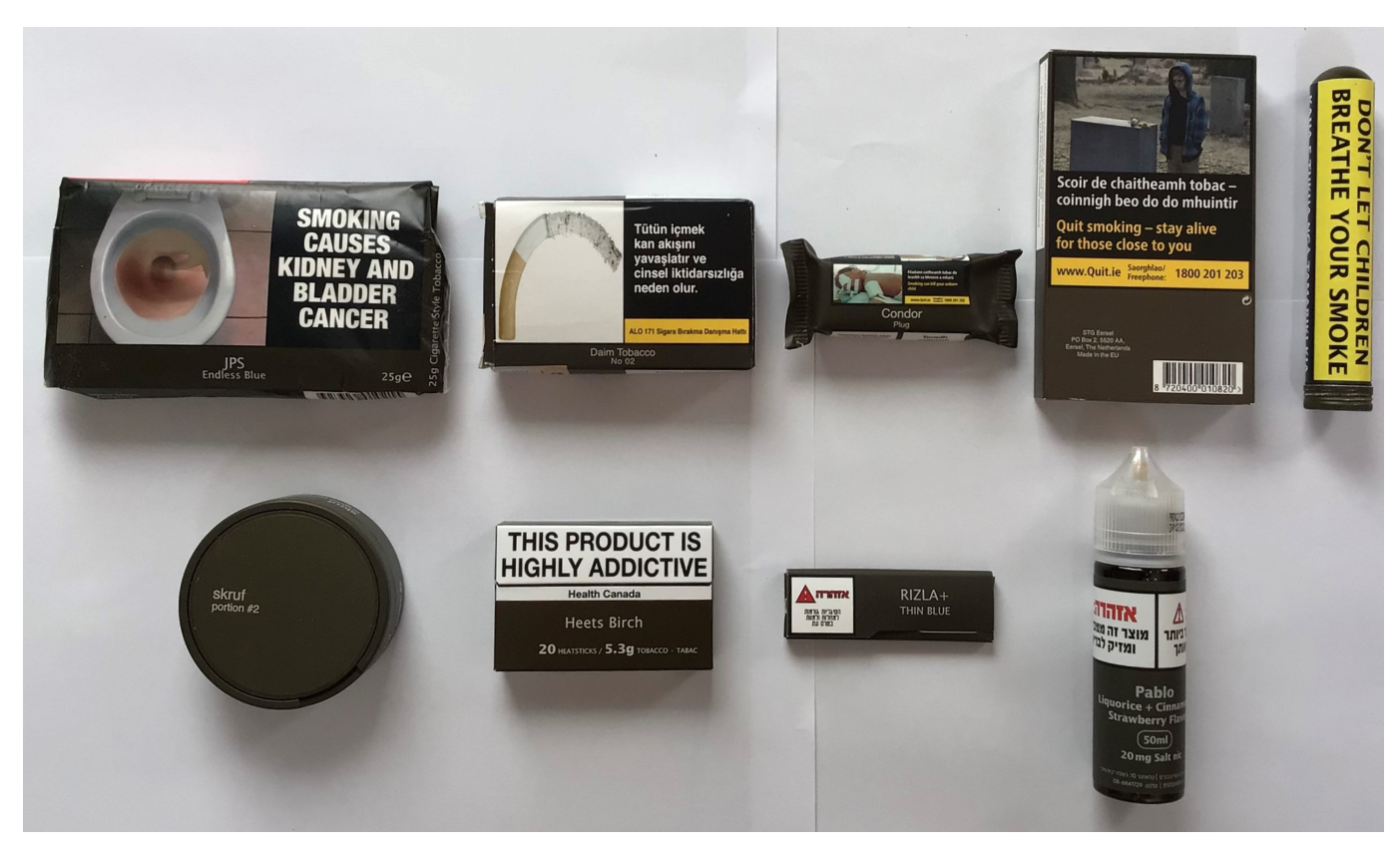
Figure 3 Plain packs for rolling tobacco (Australia), shisha (Turkey), plug, cigars (Ireland) and cigar tubes (New Zealand) (top row), snus (Norway), heets (Canada), and rolling papers, e-liquids (Israel).