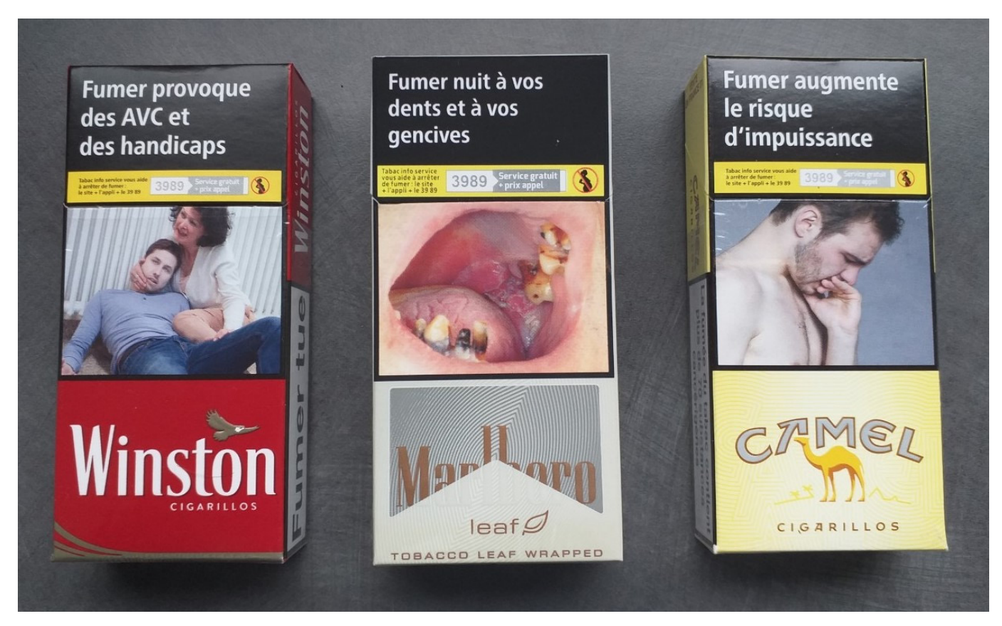
Figure 6 Cigarillo packs with cigarette branding in France.

colour, whatever colour is selected, may occur in the medium to long term and should be monitored. Uruguay's legislation allows for plain pack colours to be changed after periods of no less than 2 years<sup>80</sup>; other countries should consider incorporating this flexibility within their legislation.