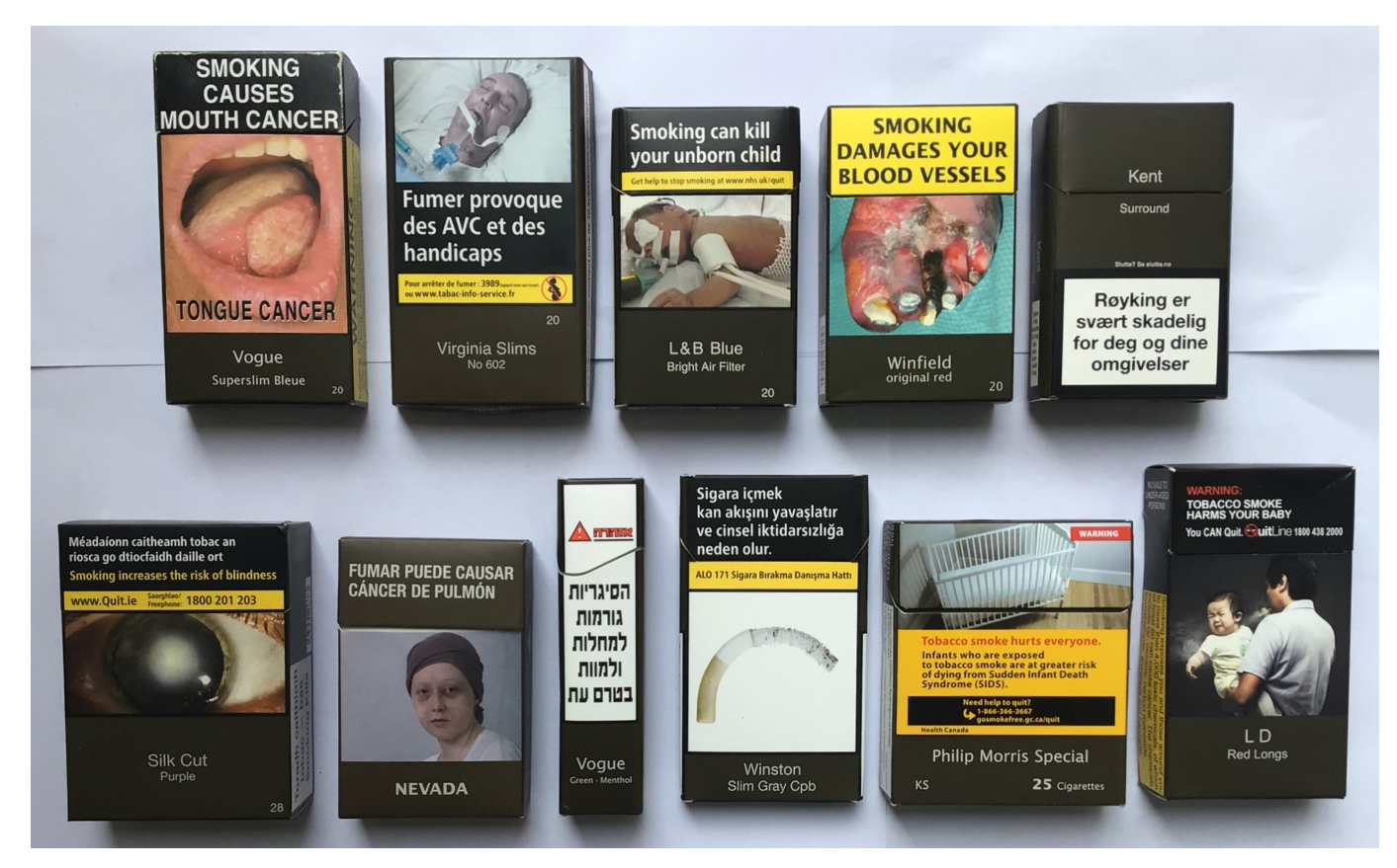
Figure 1 Plain packs in Australia, France, the UK, New Zealand and Norway (top row), Ireland, Uruguay, Israel, Turkey, Canada and Singapore.