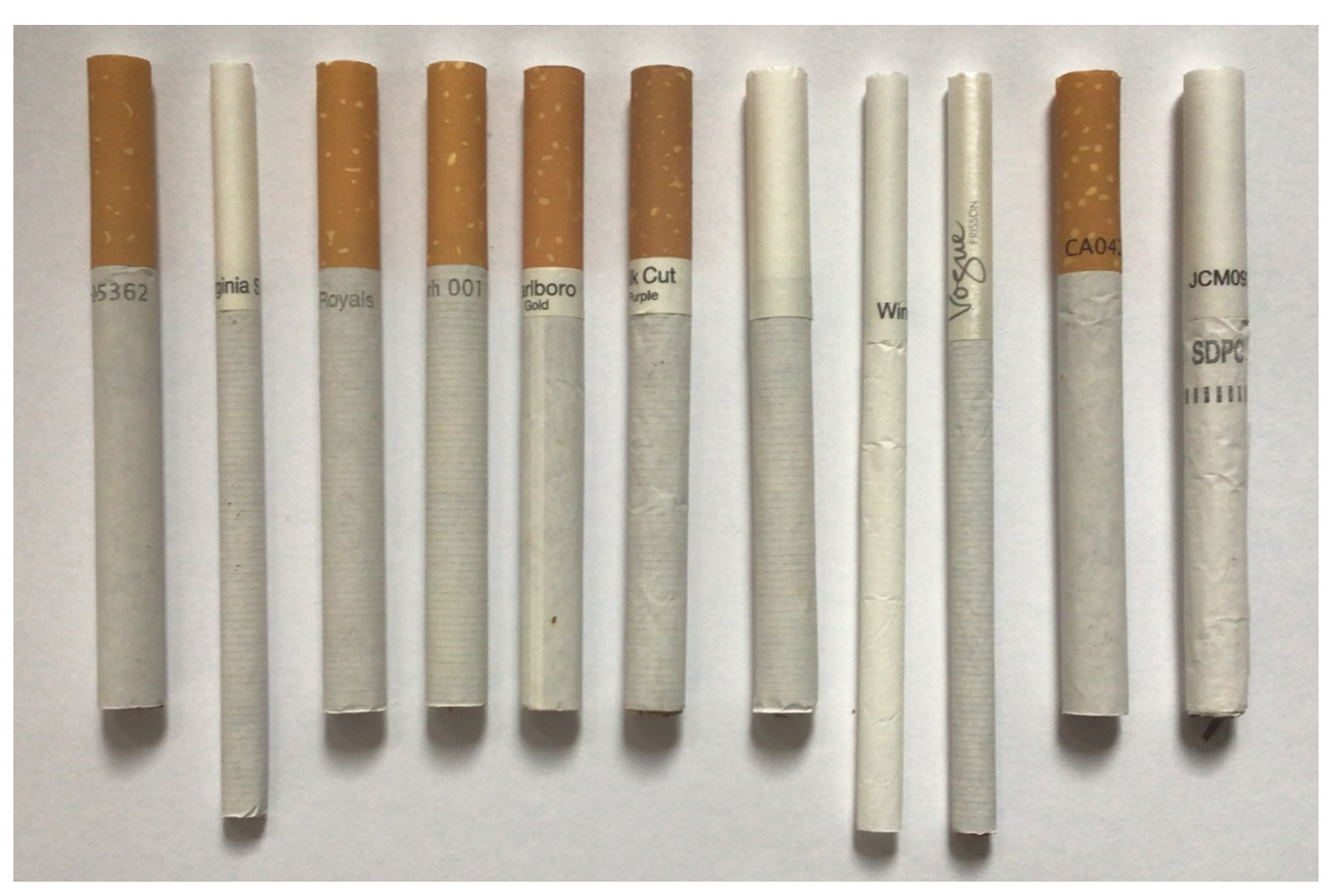
Figure 2 Cigarettes in countries with plain packaging. From left to right: Australia, France, UK, New Zealand, Norway, Ireland, Uruguay, Turkey, Israel, Canada and Singapore.

own obstacles, but strong political will, and the coalescing of civil society, advocates, public health and the medical profession can overcome these barriers. <sup>26</sup> <sup>27</sup> Furthermore, legal decisions in national and regional courts, and by World Trade Organisation panels established to arbitrate on disputes under bilateral and international trade agreements, have favoured plain packaging. When combined with increasing supportive formative and evaluative evidence from diverse jurisdictions, countries considering implementing plain packaging should have confidence this policy will be effective and withstand legal challenges. <sup>27</sup>