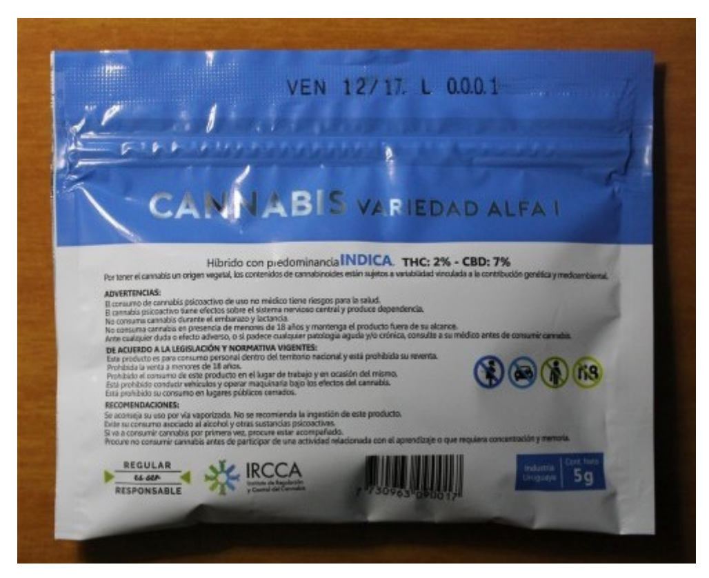
Figure 5 Cannabis packaging in Uruguay.