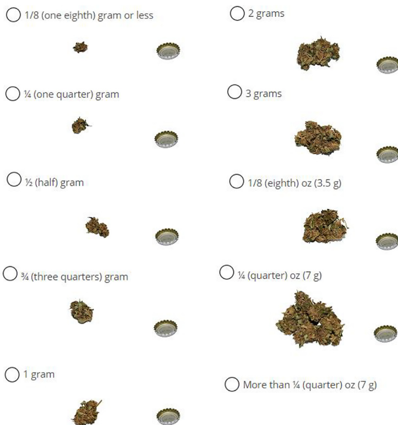
Fig. 4. (a) Reference image for dried herb reported in standard units (e.g., g, oz). (b) Reference image for dried herb amounts above 1/4 oz.