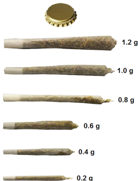
Fig. 3. Reference image for dried herb reported as number of joints.

Retail market data —As a complement to the survey data, the ICPS also collects information on the location of legal retail stores in Canada and US states that have legalized non-medical cannabis, using lists of licensed stores from state and provincial regulatory authorities, which are updated on a biannual basis (Mahamad & Hammond, 2019). Participants’ zip/postal code will be used to calculate proximity to legal retail stores.