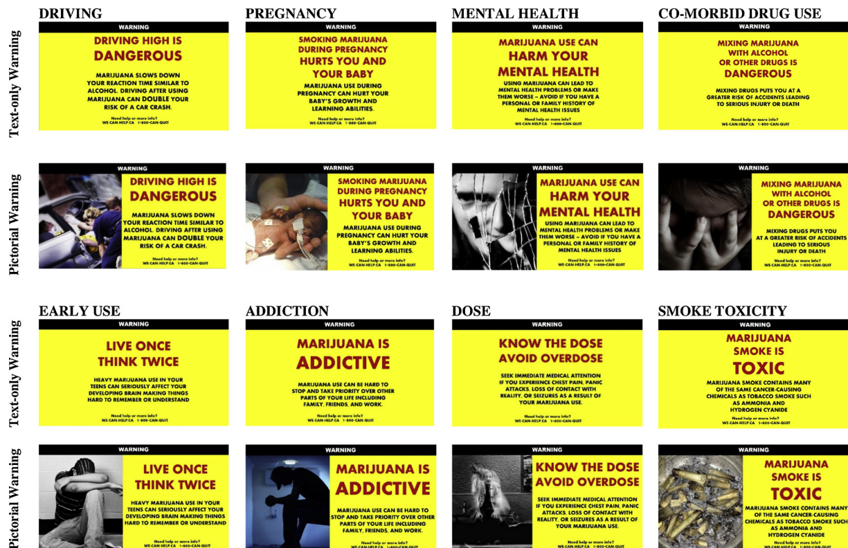
Fig. 1. Health Warning Labels presented to survey respondents.

Sociodemographic characteristics included sex (male or female),