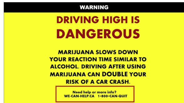
Fig. 2. Health warning label with call to action.

Following the experimental tasks, three measures of support were assessed. Respondents could respond yes/no/don’t know to the