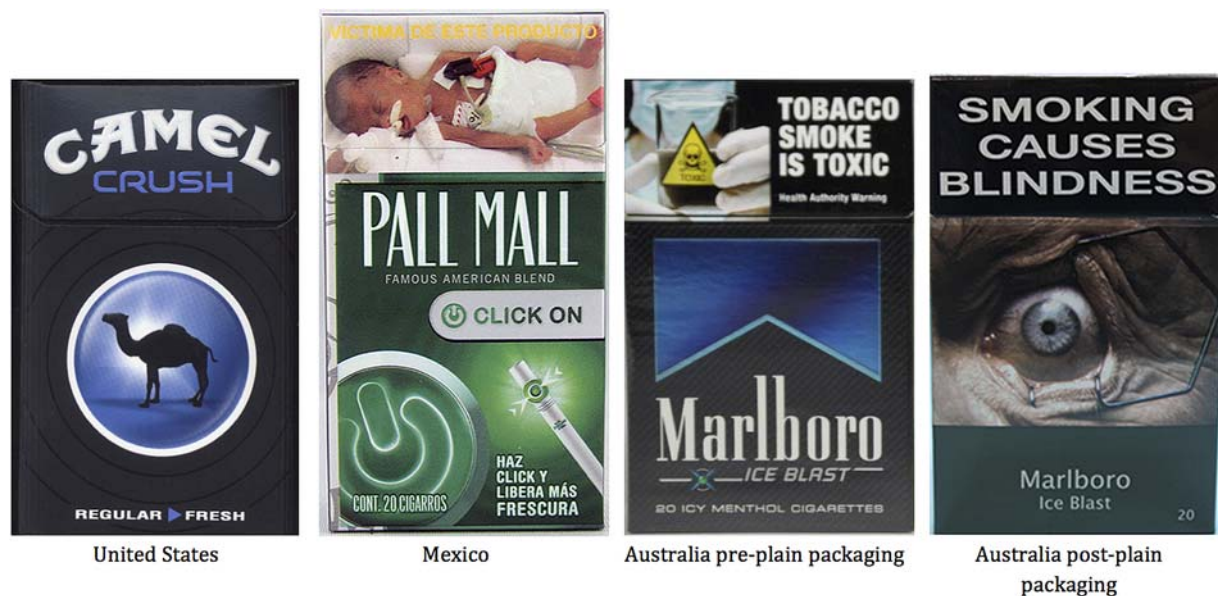
Figure 1 Example packages of brand varieties with flavour capsules in the USA, Mexico and Australia, 2014.

Brands were also classified into discount or premium price segments. For Mexico, national brands were classified as discount and international brands as premium, except for Pall Mall, as in prior research. 27 28 For the USA, we classified brands using a scheme developed in prior research that considered price and advertising image, 31 because both are critical to how the tobacco industry itself promotes premium brands. As such, this coding scheme involved assessment of pricing and tobacco industry representations of brands on industry websites and trade publications. Analyses by price segment were not