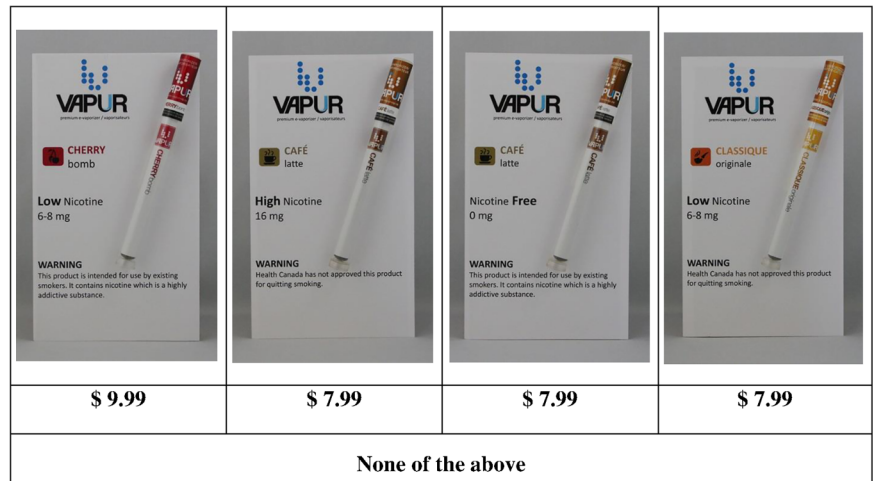
Figure 1 Sample choice set. Which one of these products would you rather try?

of gender and past trial of e-cigarettes, an adjusted multinomial logit model was created by interacting these categorical variables with each attribute. The magnitude of effect of significant findings for each attribute level was calculated using correlation coefficients and interpreted as: small ( r \leq 0.2 ), medium ( 0.3 \leq r \leq 0.4 ) and large ( r \geq 0.5 ). All analyses were conducted using SAS V. 9.4.