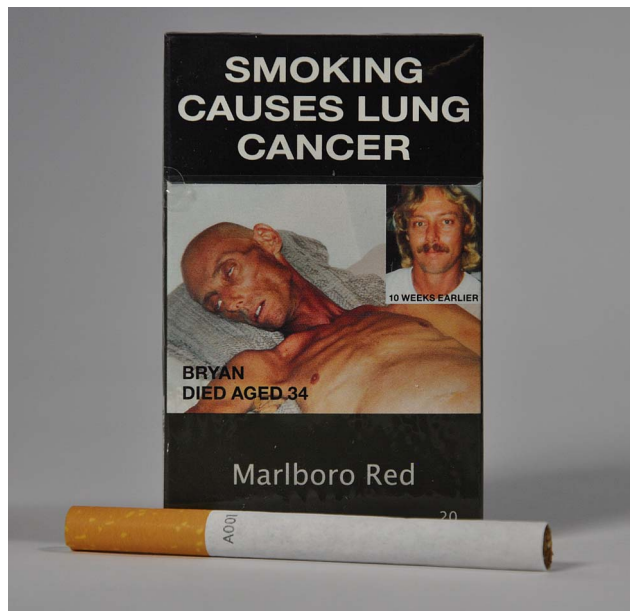
Figure 1 Pack with new plain packaging and stick.

smokers supporting a proposal similar to this, 3 and a study in Western Australia in late 2010, about 6 months after the policy was announced but 2 years before the policy was implemented, found that 34% of smokers supported PP: only slightly lower than the percentage of smokers who opposed it (38%). 4 The similarity of the level of support among smokers across these three studies suggests that support for PP among Australian smokers was fairly stable prior to implementation. What research there is shows that smokers are less supportive than non-smokers who tend to be overall net supportive. 5