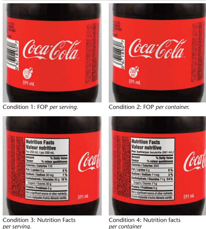
Figure 1. Experimental labelling conditions